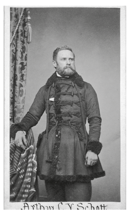
Figure 1. Arthur Carl Victor Schott.

In contrast to most regions, Yucatán supported the Second Empire. Additionally, the peninsula played an important role in the expansionist plans of Maximilian, who considered that in case of a US invasion he would move his capital to Yucatán, and also wished to extend his domains throughout Central America.<sup>50</sup> Therefore, Salazar arrived in the Mayab in September 1864 with a special agenda, plenty of power, and a good budget. Besides putting an end to the so-called Caste War,<sup>51</sup> a movement also known as the cruzo'ob uprising, the Commissioner wanted to improve the living conditions of the population through 'scientific measurements', and to attract European migration. Among his companions were four members of the Comisión Científica de Yucatán, which offered testimony to the importance given by the Empire to public works and the systematic exploration of the peninsula.