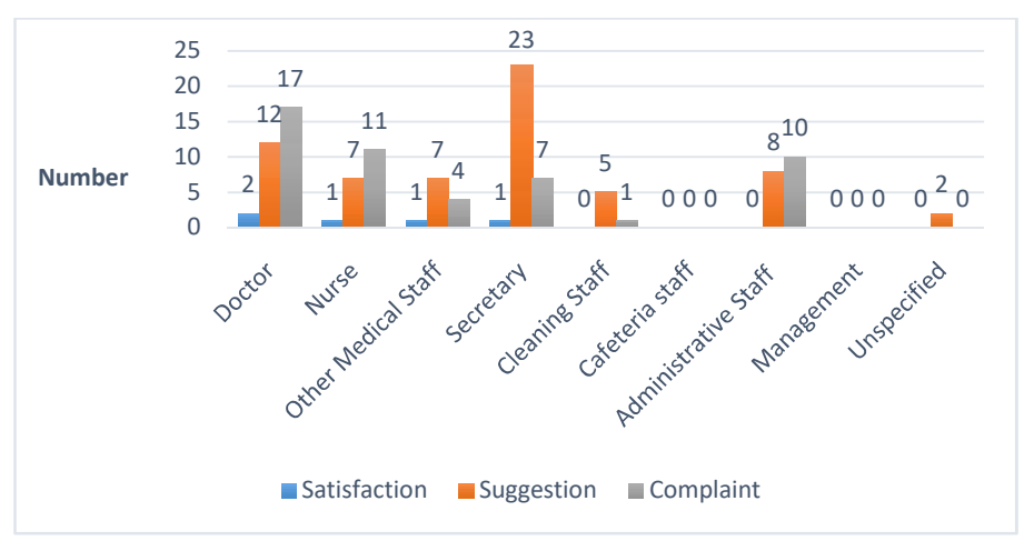
Figure 3: Distribution of views according to the types and staff

When the figure was examined, most of the suggestions were coming from secretaries (n=23), and most of the complaints were from doctors (n=17). It is also noteworthy that although the total number of secretaries was higher than all other staff, the number of complaints from secretaries was relatively low (n=7).