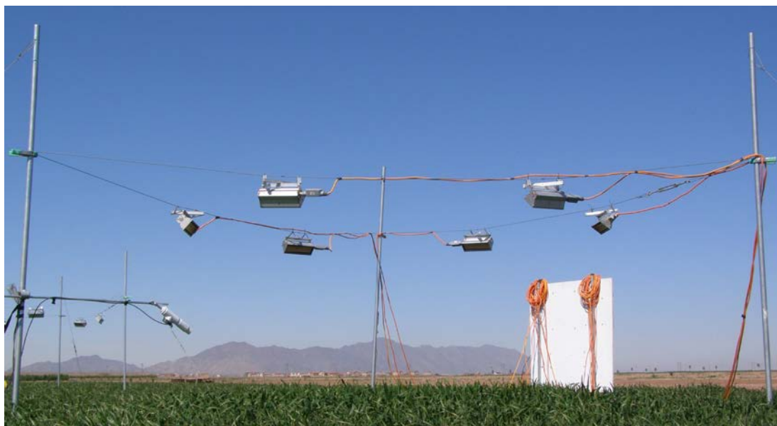
Figure 1. Photograph of the infrared heater system. In the centre foreground, infrared heaters are arranged in a circle above a wheat crop (Heated plot), and in the background to the left, the dummy non-operable heaters are arranged in a similar configuration (Reference plots).

The crops were irrigated at 100% replacement of potential evapotranspiration to maintain the soil water content at field capacity. Depending on planting date, the total amount of irrigation ranged from 362 to 921 mm. Water was supplied through a surface drip tape irrigation system with drip tapes placed 38 cm between every other row. Heated plots received 8% to 10% more water as a separate supplemental irrigation (except for the first planting on 13 March 2007) to provide a first-order correction for the increased plant-to-air vapor pressure gradient (Kimball, 2005). To guarantee good germination and emergence of the summer planted crops, additional sprinkler irrigation was provided. Soil fertility was managed to avoid nutrient limitations. Fifty to 56 kg N ha -1 and 67 kg P 2 O 5 ha -1 were applied as granular ammonium phosphate at planting, and urea ammonium nitrate was subsequently applied in irrigation water at rates of approximately 50 kg N ha -1 per application with up to four applications (at tillering, heading, anthesis and during grain filling) depending on crop requirements.