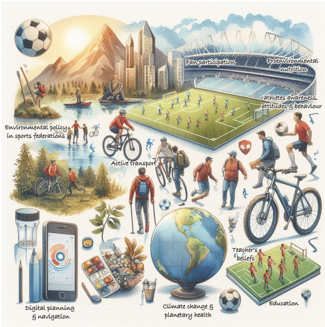
Fig. 2 ◀ Graphical overview of the topics covered in this issue on sustainable development in sport and physical activity. Graphic generated by the authors with Bing Image Creator (Microsoft Ireland Operation Limited, Leopardstown, Ireland)

velopment in the context of sport and physical activity from different perspectives (■ Fig. 2); they outline challenges and provide perspectives for the future.