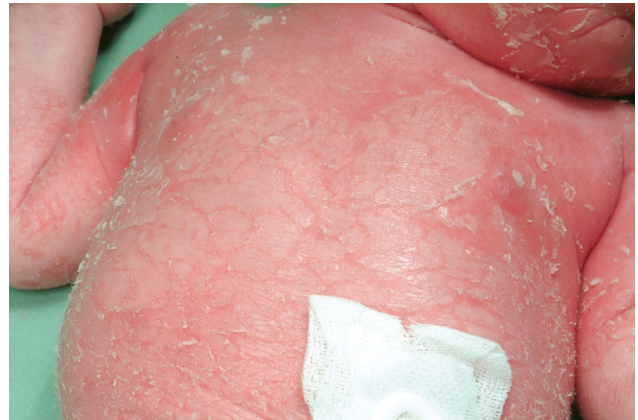
FIGURE 3 Ichthyosiform suberythroderma in Netherton-Syndrome with characteristic ichthyosis circumflexa.

symptoms) is most frequently associated with a high risk of developing concomitant allergic disease (food allergies, asthma, allergic rhinitis). 32–34