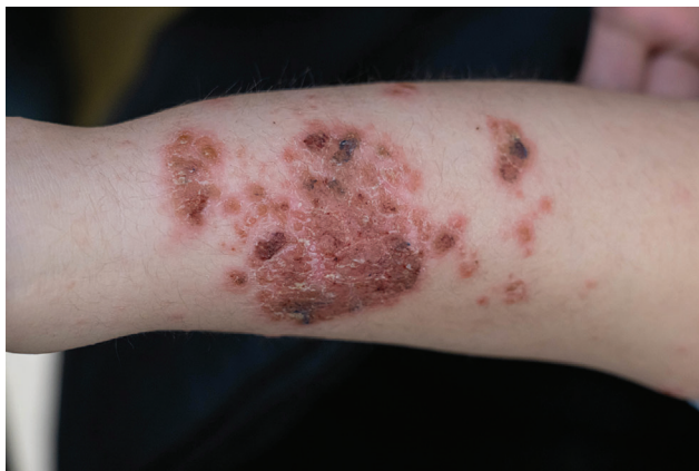
FIGURE 1 Atopic dermatitis, nummular type: infiltrated erythematous and weepy patches.

sleep duration and sleep quality and also affect concentration, memory, and stress response. 9