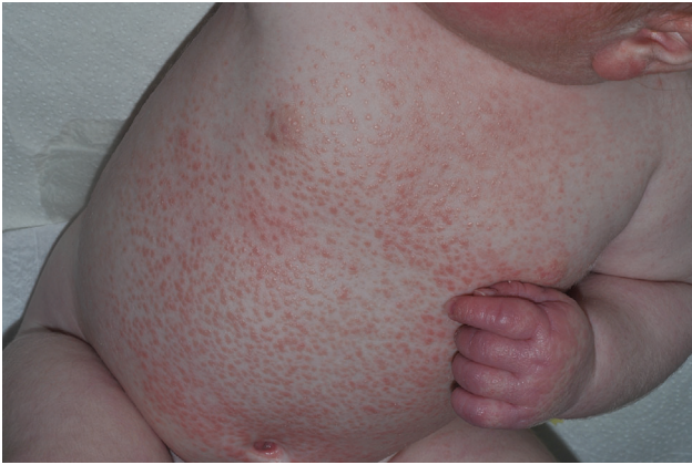
FIGURE 2 Omenn syndrome with granulomatous dermatitis.