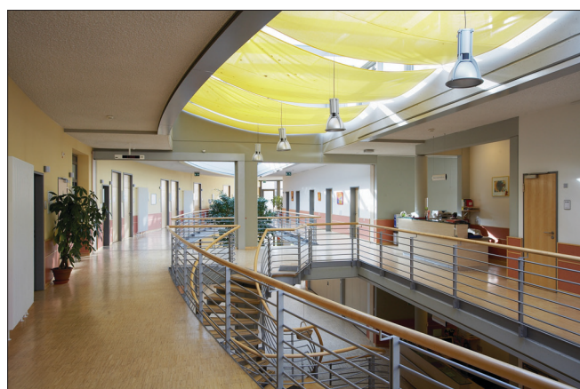
Figure 2: University hospital: Inside view

care. In the inpatient (IP) and outpatient (OP) centers of the institute, patients are treated with European medicine and traditional Chinese and Indian medicine. German, Chinese, and Indian physicians work in tandem to ensure an effective integrated approach.