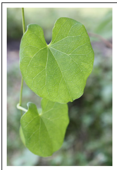
Figure 3. Guduchi or amrut ( Tinospora cordifolia ).