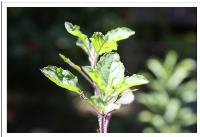
Figure 2. Tulsi ( Ocimum sanctum ).