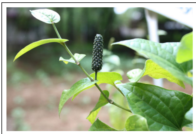
Figure 4. Pippali ( Piper longum ).

of storage, and the chosen method of pharmaceutical processing. 27 However, herbs are natural materials, and their constituents may vary due to differing geographical locations, climatic conditions, environmental hazards, harvesting methods, and collection protocols. Such factors make it difficult to standardize or reproduce the quality of the end product. 28