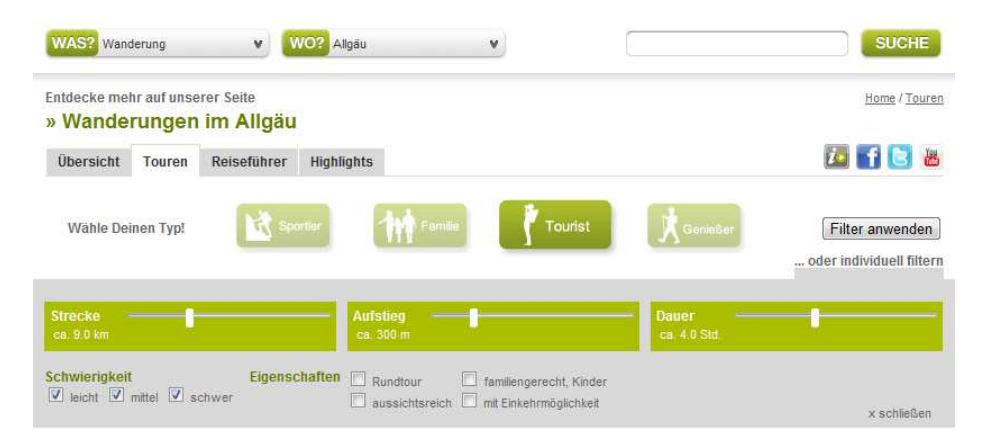
Fig. 2. Annotated Search Mask of Preference Search

For evaluation purposes, basically the same search mask as for Faceted Search (see Fig. 1) including the 3 attributes of length, ascent and duration is used as depicted in Fig. 2.