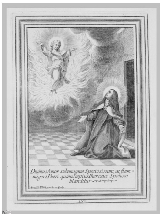
11 A. van Westerhout