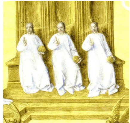
16 J. Fouquet, Heures d'Étienne Chevalier ; Chantilly, Musée Condé