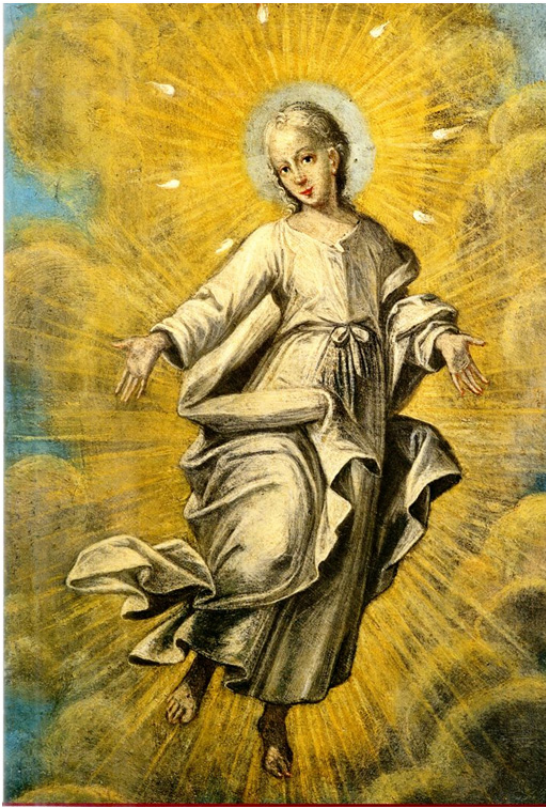
1 copy after J. Ruffini; Kaufbeuren, Crescentia Monastery