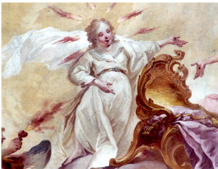
22 B. Riepp; Großaitingen, parish church