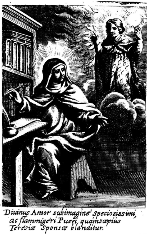
9 Essercizi affettivi ... , Rome 1670