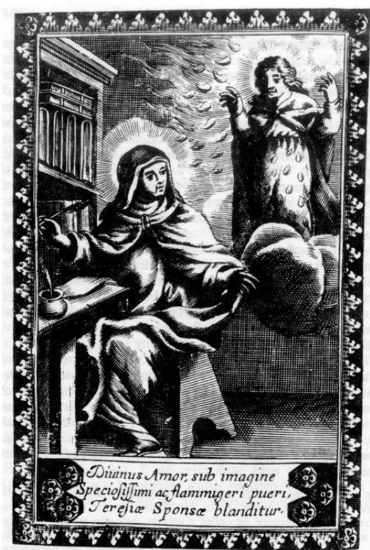
10 Vie de la seraphique Mere ... , Lyon 1670