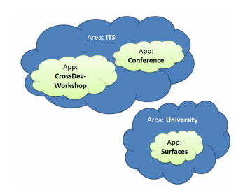
Figure 2: Partitioning concept for MSEs: areas as containers for application environments. Multiple logically separated application areas can exist within the same physical network.