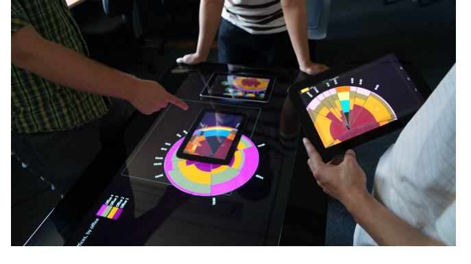
Figure 1: Interactive portals with mobile devices and tabletop.

During the last decade, people's interaction habit with daily devices has changed remarkably. While ten years ago peo-