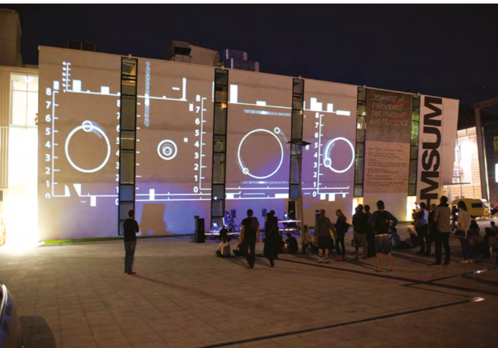
Fig. 11: Summer night in a museum, MG+ Museum of Contemporary Art Metelkova, Ljubljana, 2012.