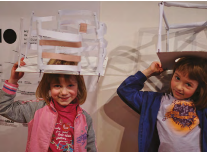
Fig. 20: Sunday DIY architecture workshop, Museum of Architecture and Design, Ljubljana, 2013.