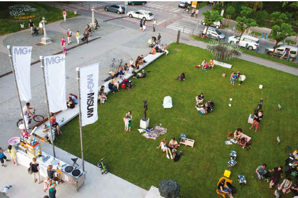
Fig. 1: Summer night in a museum, MG+ Modern Art Gallery, Ljubljana, 2013.

Identifying with the past actually enables the feeling of being stuck and being forgotten institutions, lost and helpless when it comes to coping with necessary changes. But if we start looking at museums as Social Arenas, then we can see them as a bridge between the gaps of time – between past and present; and also as bridges between societies.