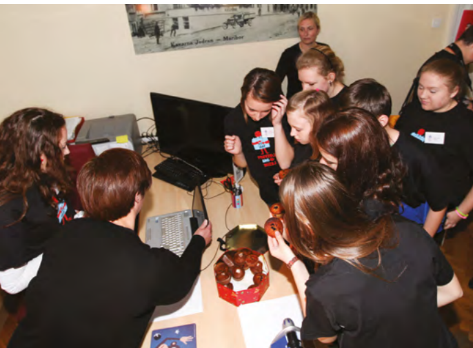
Fig. 21: Museum has been taken over. The new director has prepared a sweet surprise for her co-workers. National Liberation Museum, Maribor, 2013.

It is important to emphasize the educational role of museums. They are primarily seen as didactic and educational institutions that encourage people to develop their imagination and offer opportunities for a meaningful educational experience . The exhibited museum collections are invaluable sources of education. They facilitate informal learning for people of all age groups, ethnic backgrounds and levels of interest – they are informal places of learning where children and adults can step outside the systems of learning they are usually subjected to.