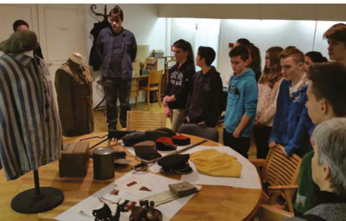
Fig. 37: Pupils discovering the museum treasures in depot while getting to know the curators work. National Museum of Contemporary History, Ljubljana, 2015.