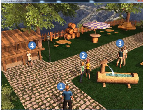
Fig. 1. Screenshot of the Virtual Beergarden.

dialog-based interaction styles on the users' experience, we created a user interface that accepts typed text input and a narrative engine that is able to provide appropriate reactions to the user input.