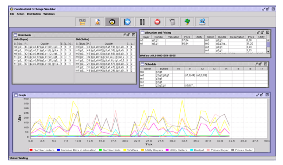
Figure 1: Combinatorial Exchange Simulator

technical properties. Figure 2 sketches briefly the main components of the market simulator.