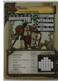
(a) Card (front)

Attributes and special abilities of a unit are noted on a card, as shown in figures 2(a) and 2(b). Also each time a unit takes damage, this has to be recorded on the damage grid on the front of the card.