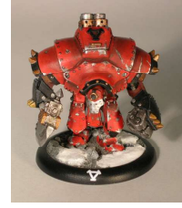
(b) Painted model