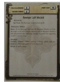
(b) Card (back)