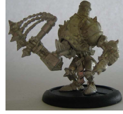
(a) Glued model

The game is centered around these units. Those units are represented by miniatures, which must be first glued together, and are usually painted individually. Typical Warmachine miniature are shown in figures 1(a) and 1(b).