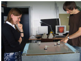
Figure 4: An evaluation session

tangibles or virtuals for the miniatures.