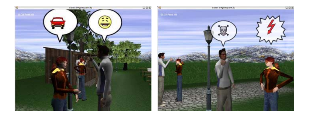
Fig. 2. Interacting agents

[6] distinguishes four different distances that are related to behavior changes which occur if someone enters these distance zones. Intimate distance ranges up to 45 cm and is reserved for very close relationships. Personal distance ranges from 45 cm to 1.2 m which allows touching and is thus reserved for focused and private interactions. Social distance ranges from 1.2 m to 3.6 m, public distance starts at 3.6 m. The specific distances given by Hall are valid for white Northern Americans. Whereas the existence of the four different distances seems to be universal, the ranges itself and acceptable behaviors related to the distance zones are culture specific. Relying on Hall, Knowles [10] has developed a straightforward model based on proximity to handle the effects of crowding. In essence, the influence of others results from a combination of their number and their distance from the target person.