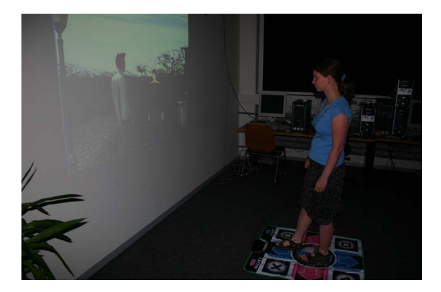
Fig. 3. Joining a group of agents

According to the media equation [18], it should not make a great difference whether humans approach a virtual agent or another human. Indeed a number of studies by Bailenson and colleagues [1] revealed that the size and the shape of the personal space around virtual humans resembled the shape of the space that people leave around real, nonintimate humans. Nevertheless, Bailenson and colleagues also observed that the social navigation behavior depends on whether the agent is controlled by a computer or by a real human. In particular, they found out that people gave an avatar more personal space than an autonomous agent. In a second experiment, they examined what happens when virtual humans walk and violate the personal space of the participants. The experiment showed that human subjects avoided the virtual human more when it was obviously computer-controlled than an avatar that was controlled by another human.