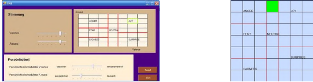
Fig. 3 Setting the agent’s initial emotion (left, above) and its personality (left, below) and visualising the agent’s emotional state (right).