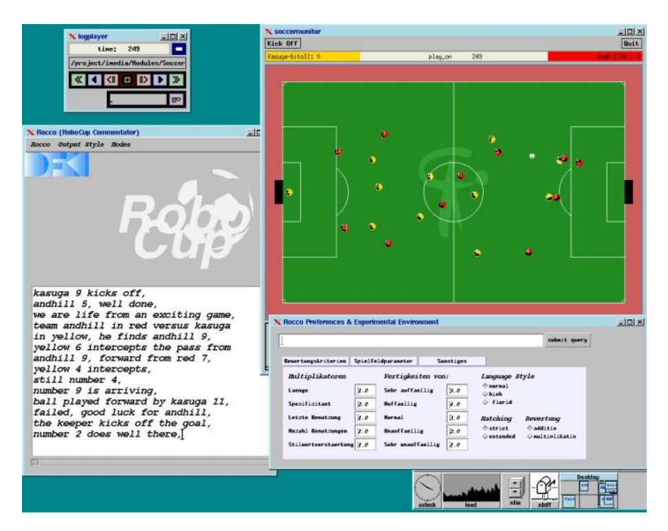
Fig. 2. The basic windows of the initial Rocco system

their locations over time, together with additional world knowledge about the objects. High-level scene analysis provides an interpretation of this basicly visual information and aims at recognizing conceptual units at a higher level of abstraction. The information structures resulting from such an analysis encode a deeper understanding of the time-varying scene to be described. In general, they include spatial relations for the explicit characterization of spatial arrangements of objects, representations of recognized object movements, and further higher-level concepts such as representations of behaviour and interaction patterns of the agents observed (see [6]).