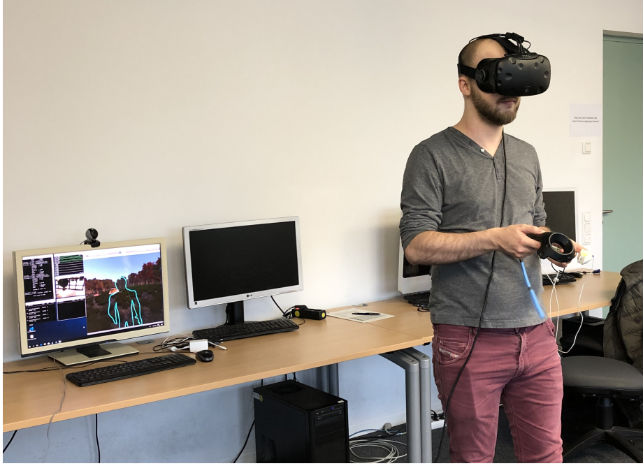
Fig. 1. A participant using the experimental setup. The controller is in his right hand while the sensors are attached to his left hand and chest. Behind him is the computer on which VR scene is rendering and the physiological signals are recording.