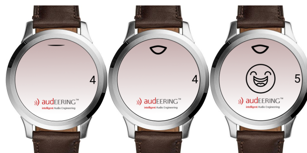
Figure 1: Runtime screenshots from a smartwatch: no speech, speech, and laughter as detected in real-time from the microphone signal.

We realised an app running on a smartphone as well as on a wearable device, the recognition of laughter will be performed in realtime from the devices input audio microphone. For both scenarios, the app is capable of giving a visual indication when laughter is recognised from speech or not, as depicted in Figure 1. Additionally, general voice activity is detected and shown