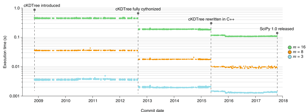
Fig. 3 | Results of the scipy.spatial.cKDTree.query benchmark from the introduction of cKDTree to the release of SciPy 1.0. The benchmark generates a k -d tree from uniformly distributed points in an m -dimensional unit hypercube, then finds the nearest (Euclidean) neighbor in the tree for each of 1,000 query points. Each marker in the figure indicates the execution time of the benchmark for a commit in the master branch of SciPy.

not require unit tests. Documentation for the code is automatically built and published by the CircleCI service to facilitate evaluation of documentation changes/integrity.