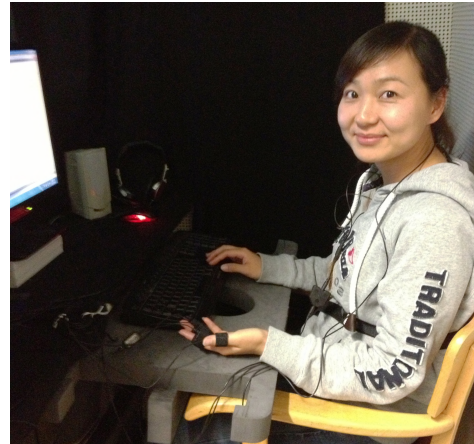
Figure 2: A participant inside the booth with the electrodes attached to her just before the experiment.

The participants were asked to sit inside a sound proof booth (see Fig. 2). Music was played with two speakers at a convenient volume level tuned by the subject. Each subject listened to 8 music excerpts (two from each 2DES quadrant) according to a balanced Latin square design (to reduce carryover and fatigue effect), and therefore every music piece was rated by at least 12 participants. Each trial lasted for 1’20”: 30 seconds of silence followed by 50 seconds of music. After listening to each piece, participants filled in GEMIAC and indicated how much they liked the music. They were also asked to point out whether they knew the music. 85% (=164) of the trials were rated as “I didn’t know it”, 15% (=28) as “I think I heard it before”, and 0% as “definitely knew it”. Since there is not much variance in this variable, we omit it from the calculations. In between each trial there