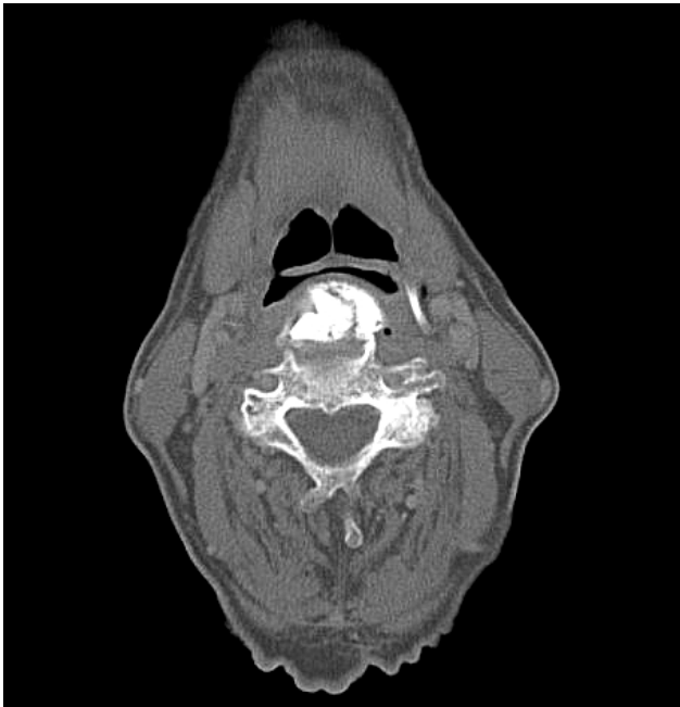
FIGURE 3 | CT: axial scans showing a thin cleft between epiglottis and anterior osteophytes at the level of C3.

and fasciae, particularly of the spinal column (11). Why this entity usually remains asymptomatic and which patient group become symptomatic remains unknown.