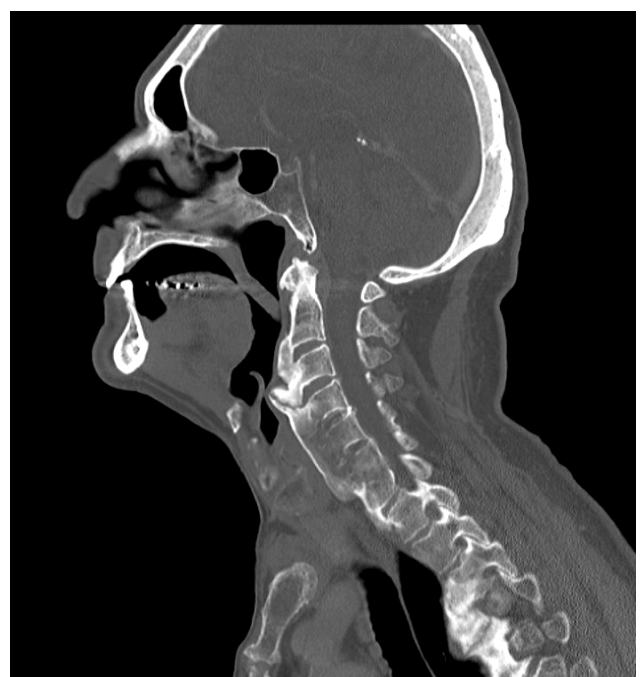
FIGURE 2 | CT: sagittal scan showing anterior osteophytes and ossification of the anterior longitudinal ligament.

Cervical hyperostosis or Forestier's disease is mostly an asymptomatic malady described as a noninflammatory ossification with severe formation of osteophytes affecting ligaments, tendons,