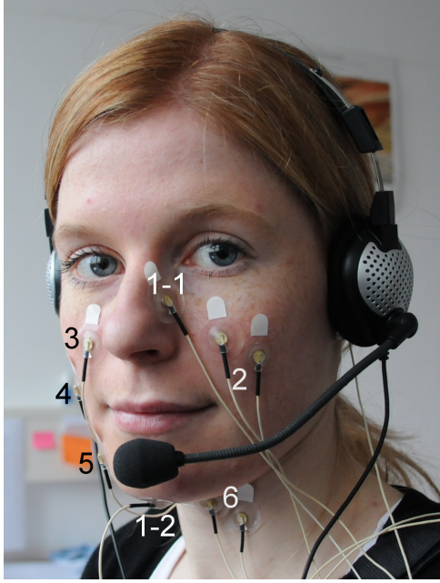
Figure 1: EMG-UKA electrodes with bipolar derivation (white) and derivation against a neutral reference (black numbers).