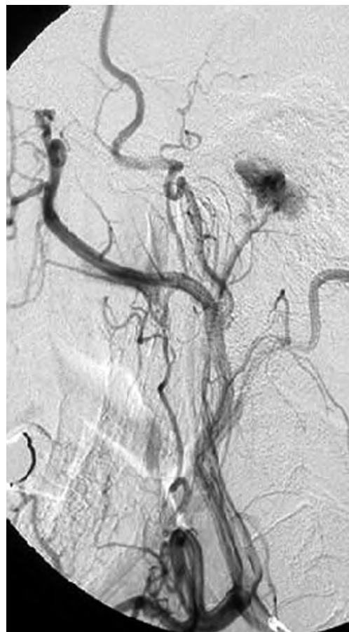
Figure 1 DSA revealing a highly vascularized tumor on the right promontory.

On histopathological examination, the tumor consisted of spindle-shaped cells. The tumor cells showed no significant