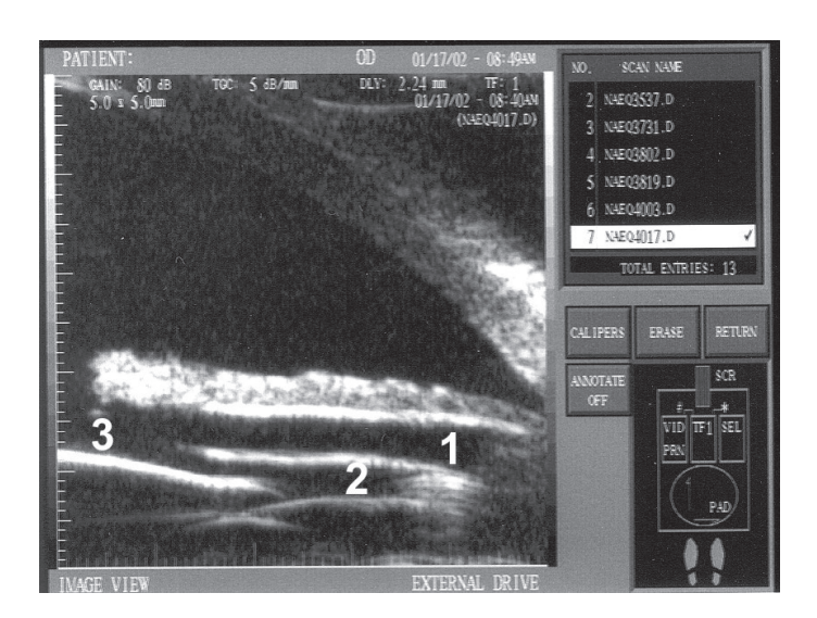
Figure 2 UBM findings after CTR and IOL insertion (intraoperative zonulolysis over 4 clock hours) (Fries et al 1998). Notes: CTR (1), haptic of IOL (2), and IOL (3). Abbreviations: CTR, capsular tension ring, IOL, intraocular lens; UBM, ultrasound biomicroscopy.

A weakness of the present study is the retrospective nature and the lack of a control group. Obviously, only a prospective randomized study could further elucidate whether the same clincial outcome (eg, possibility of PCIOL implantation) could be achieved without prior implantation of a CTR. However, the following aspects should be considered in this context: First, based on our study with a frequency of CTR implantation of 0.7%, the number of cataract cases included will have to be very large to achieve statistical power. Second, the decision whether to implant a CTR or not is usually made during surgery; this approach interferes with a prospective randomized study setting. Third, patients would have to give their informed consent prior to surgery allowing for the randomized (non-) use of a CTR even in the event of