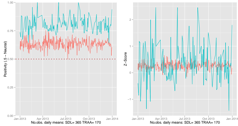
Figure 2. Daily sentiment means (left) and z-scores (right) of daily sentiment means for Cisco. The daily mean counts on the charts refer to the number of available daily data points prior to linear interpolation of missing values.

seems to be an indication that analysts are hesitant to use negative language. One possible way to address the apparently domain-specific language of stock analyst would be to compile a sentiment dictionary specifically for the domain. In the meantime, following the method applied by Bollen et al. (2011), z-scores of both time series are used to normalize the two series around a common level (Bollen et al. 2011, p. 3), resulting in the centered series illustrated in figure 2 (lower right). 5