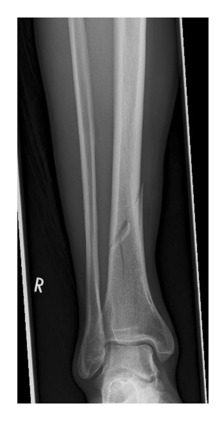
Fig. 2 Type B