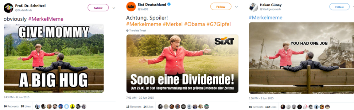
Figure 1. Adaptations of the Merkel Meme.

The concept of an Internet meme (Milner, 2016; Shifman, 2012, 2014) comprises relatively new and diffuse types of texts (motifs, phrases, pictures, and videos) that spread through social media. Their encompassing nature has resulted in the term being operationalized differently. Some studies focus on written text memes such as quotes (Shubeck & Huette, 2015), and others concentrate on moving images such as YouTube memes (Shifman, 2012; Xie, Natsev, Kender, Hill, & Smith, 2011). Overall, Internet memes are considered as part of a participatory digital culture (Shifman, 2014, p. 18; Wiggings & Bowers, 2015, p. 1886), often picking up political and pop cultural content (Shifman, 2014, p. 51).