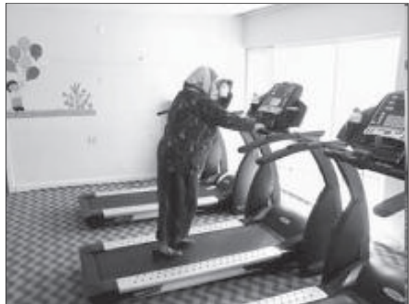
FIGURE 1: Exercise room within the family practice center with treadmills.

▪ Modified glyceic diet (D2): Glyceic Index (GI) is a scale which ranks foods by how much they raise blood glucose levels compared to