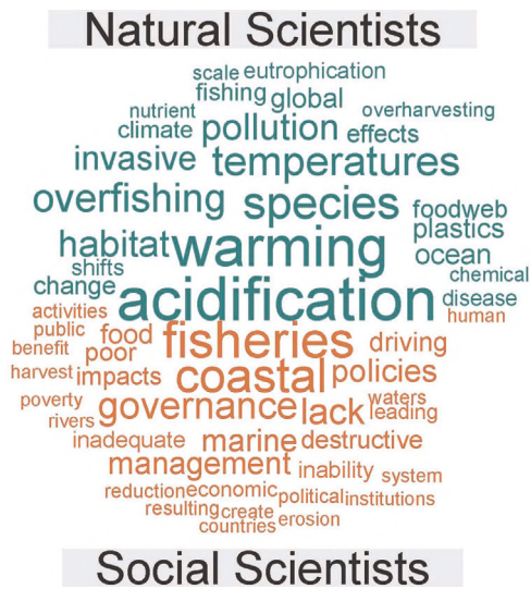
Fig. 4. Comparison cloud. The size of the words indicates relative differences between the rates that an item is mentioned by natural scientists (green) and social scientists (red) (For interpretation of the references to color in this figure legend, the reader is referred to the web version of this article.).