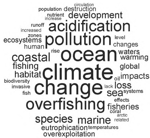
Fig. 3. Commonality cloud. The size of the individual categories indicates their relative frequency, i.e. how frequently items were mentioned by all respondents in the survey.