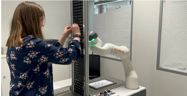
Figure 1: Collaboration between a person and the LBR iiwy.