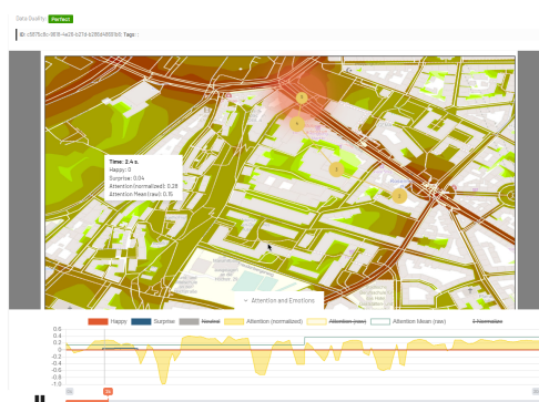
Figure 2. Online webcam eye-tracker result