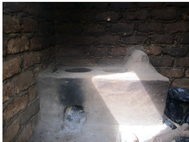
Fig. 2. Selected stove design.

After the selection of the stove design, field testing of the ICS using a controlled cooking test (CCT) [37] was jointly conducted to analyze how efficient the ICS is compared to TSF. Prior to the tests, the quantity of ingredients, types of fuels and pots used during the CCT were jointly agreed upon with the study participants to reflect the normal cooking preferences and practices of the community. Whenever possible, both male and female representatives of each selected household were involved in the process. Nevertheless, this was not always possible and, thus, only a female or male representative was trained from the