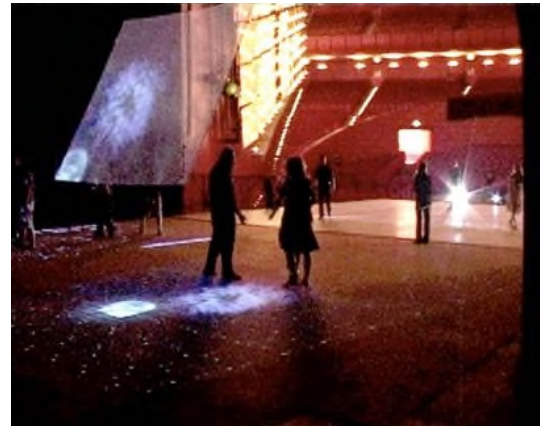
Figure 2. Galassie