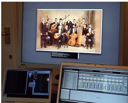
Figure 5. Music Kiosk