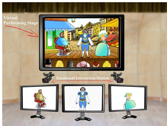
Figure 4. Interactive Opera