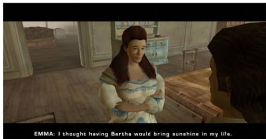
Figure 6. EmoEmma

this reason, our experiences are really gained under real-life conditions.