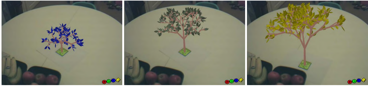
Figure 1. E-Tree reacting to emotional input: negative/low-arousal, neutral and positive/high-arousal

mented Reality art installation of a virtual tree that grows, shrinks, changes colors, etc. by interpreting affective multimodal input from video, keywords and emotional voice tone (Fig. 1).