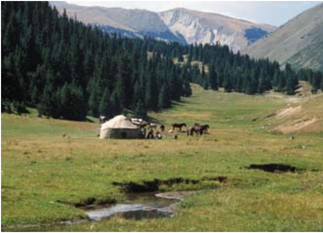
Fig. 1: Animal husbandry plays a major role in most households in Issyk Kul BR.