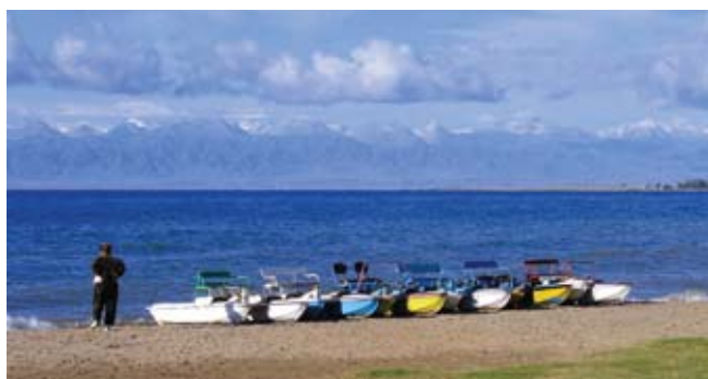
Fig. 3: The lake Issyk Kul offers many opportunities for leisure activities.