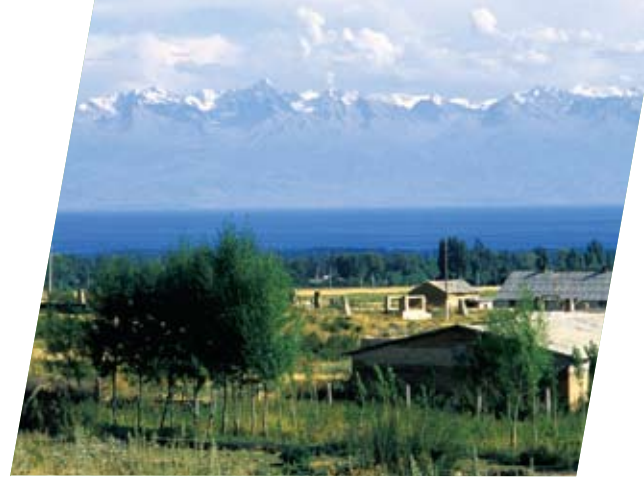
Lake Issyk Kul is said to be the second largest high-mountain lake in the world.