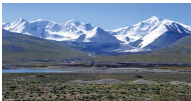
Fig. 2: Gold mine in Issyk Kul BR.

A conflicting discrepancy between economic utilisation and ecological goals is obvious with regard to mining activities in the area. The Kumtor gold mine, run by a Kyrgyz-Canadian syndicate, plays a particularly important role in the national economy of Kyrgyzstan, because it generates more than ten per cent of the national income. The gold mine is located at approx. 4,200 metres above sea level in a zone which is extremely fragile in ecological terms (Fig. 2). For the extraction of gold, large amounts of toxic chemicals are necessary, leading to the contamination of glaciers and high mountain steppes in the vicinity of the mine. Tonnes of highly toxic waste are produced day by day and deposited on site. But the mine is located within the catchment area of the Naryn River, the major tributary of the Syr Darya, which is the lifeline for millions of people in Uzbekistan and Kazakhstan. An accident would have dramatic consequences for all Central Asia. Furthermore, the transport of tonnes of fuel and toxic chemicals across the BR represents a constant danger to the environment and a serious threat to the whole ecosystem. Already in 1998, a truck accident led to the spillage of approx. 1.7 tonnes of cyanide into Lake Issyk Kul, resulting in an ecological disaster (Moldogasieva 1998).