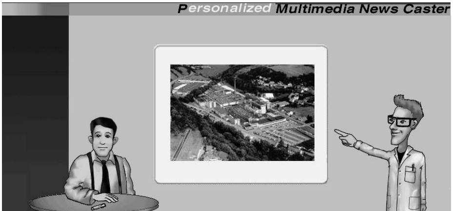
Fig. 7. The Virtual News Agency.

Since the other two player technologies do not include any facilities for controlling the timing of other dynamic media, we decided to rely on the Synchronized Multimedia Integration Language 7 (SMIL) in this application scenario. SMIL is a standard recommended by the W3 consortium with the aim of adding synchronization to the Web. As in the other two applications, we use our presentation planning technology to generate expressions in the SMIL language that are played within a web browser using a SMIL player that supports streaming over the web, such as the Real Player 7 Basic 8 . However, since SMIL requires the specification of a spatial and temporal layout, the following extensions have become necessary: