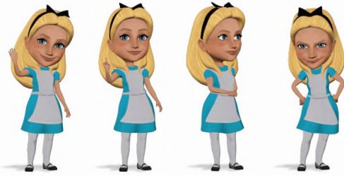
Figure 3: Samples of Alice expressive posing.

ence demo setting, i.e. multiple people interacting with it, or a user suddenly addressing one of their colleagues instead of Alice, or a user simply walking away from the interaction mid-interaction.