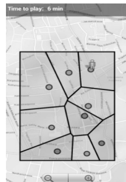
Fig. 1: Screenshot of a possible winning configuration for team “orange”

game is to occupy virtual areas moving around outdoor on a real world gameboard. The board and the position of the team are displayed as a semantic overlay of a map on the screen of the mobile device which each team uses. The players have to find certain geographic locations on site to occupy these areas, i.e. the areas are marked in the colour of the specific team after they have solved a game task and are not accessible to the other team any more. Areas are derived from defined locations by attaching all points in space that are closer to that specific location than to any other, to a centre location (Voronoi segmentation). For the purpose of balancing the game temporarily at each location, a specific task must be solved to occupy the area (cf. KIEFER et al. 2007). This task can be knowledge-based, it can be verbalized as an exploration task, or it can meet the function to collect (subjective) geo-data, e.g. referring to the quality of one's stay in a certain place. With these or other location-based data, maps can be composed in the post-processing stage. A combination of multiple tasks in one location is also possible. Each team can view on their screens the areas already occupied by the opposing exteam, and therefore must adapt their strategic decisions. In one of the possible game configurations the team which conquered the largest area wins (see fig. 1). It is advisable to subordinate the game with all its content under a geographical central question or central topic.