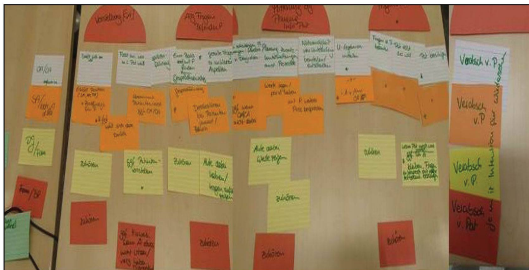
Figure 1. Exemplary map of the ward round script of one medical student. Half-round shapes on top represent scenes (i.e. representation of phases of a ward round), cards in the left column indicate roles (i.e. representation regarding what participants form a ward round team), cards in rows represent scriptlets (i.e. activities that were mentioned as typical for each role).

Therefore, we added a category labelled as non-demanding activities which included activities that were neither linked to the ward round goal ‘provide patient care’ nor to the goal ‘provide learning opportunity.’ An example from the data of one medical student was: ‘I just stand around and look friendly.’ Inter-rater reliability was assessed based on independent double-coding of 20 percent of the data by two raters, counterbalancing for different expertise groups, gender and field of internal medicine. Inter-rater reliability was very satisfying (Cohen’s \kappa = 0.87 ).