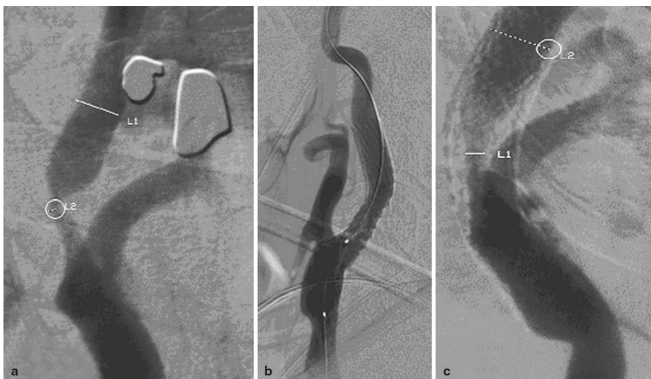
Fig. 2 Despite of initial complete stent expansion with the use of postdilatation, restenosis had occurred after time lapse. a , Initial lesion with > 80\% stenosis b , immediate good results after stenting of the lesion c , severe in stent restenosis during the period of follow up