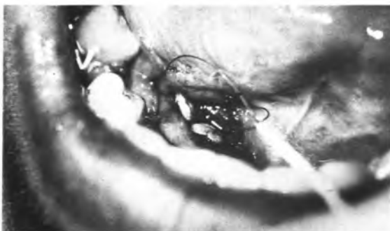
Fig. 2. Removal of fragments by a dormia basket after laser lithotripsy of a submandibular gland stone.

wards, the laser fibre together with the irrigation unit were put into the working channel of the endoscope. The treatment of salivary calculi with laser pulses happened under direct optical control with simultaneous NaCl irrigation.