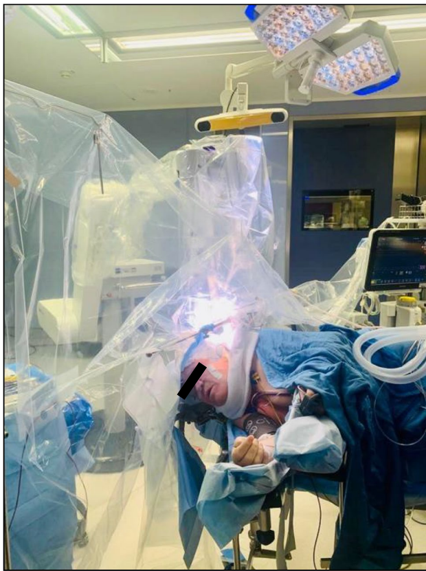
Fig. 4 IORT following metastasis resection via an asleep-awake-asleep approach in the surgery room of the University Hospital Augsburg

The anesthesiological management of asleep-awake-asleep craniotomies, in which general anesthesia or analgesedation is intermittently interrupted for neurological testing, needs specific requirements and a coordinated setting. It requires profound knowledge of neuroanesthesia including advanced airway management, to avoid complications during the procedure [13]. The anesthesiological procedures are a balancing act between overdosing anesthetics leading to impairment of respiration and alertness and underdosing directing pain, strain, and stress to the patient [12]. Pain