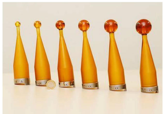
Fig. 1 According to the resection cavity, different diameters of the spherical applicator from 1.5 to 5.0 cm are available to carry out the intraoperative irradiation

After the tumor resection, the applicator size (Fig. 1) is chosen by the neurosurgeon according to the size of the resection cavity, and the spherical applicator was then gently inserted into the resection cavity. Attention is paid to avoid additional pressure of the applicator, which is covered