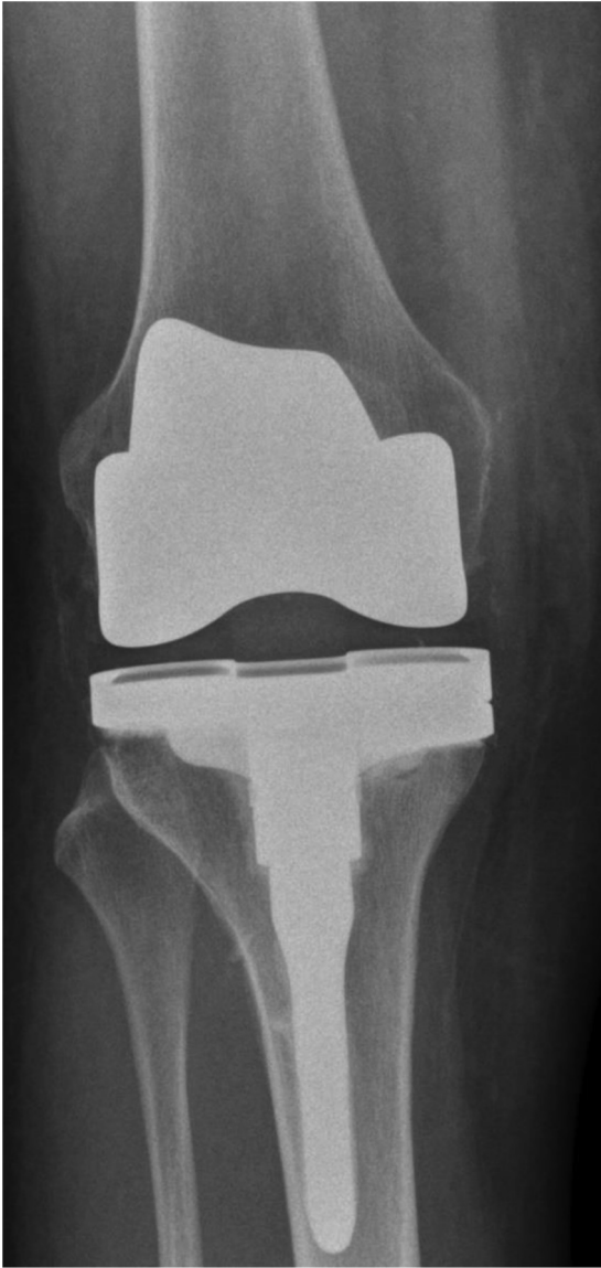
Figure 5. Postoperative radiograph: standard modular tibial revision implant with medial augmentation to bridge the deep bone defect.

[6,11,13,18,24]. What is hidden behind this label “unknown” or “nonspecific pain” stays unclear.