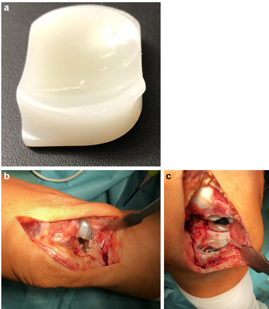
Figure 4. (a) Anterior medial deformation of the inlay. (b and c) Extreme posterior position of the inlay in extension and flexion.