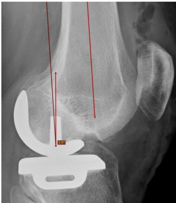
Figure 1. Typical indentation at the femoral condyle in the anterior aspect of the implant. Femoral component in 3.5^\circ flexion for the central axis under orientation at the central anchor pin.

The revision intervention with the change to a complete bicompartamental knee arthroplasty led to a satisfying outcome without complications. All patients were free of complaints after completing full rehabilitation. After 12 months, all 14 patients were